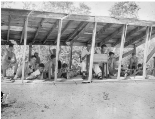
Old Rifle Range