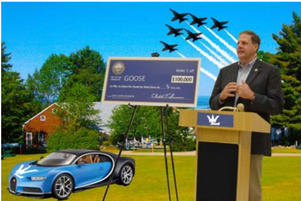
PHOTO CAPTION: Chris Sununu presents Goose with a check for $100,000 and a new Bugatti as Blue Angels fly overhead, in the obviously NOT Photoshopped picture.

"Wow! This was COMPLETELY unexpected!" raved Goose at the microphone. "I can only imagine what great things you have planned after my 29 th year!!"